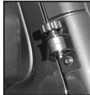
JK Install pic.8

NOTE: TJ applications are designed to be used with doors off. Some visibility on passenger side will be blocked if used with doors.