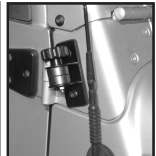
TJ-LJ Install pic.9

Step 7. When doors are reinstalled remove mirror arm from bracket. Place bushings back into arm. Tighten knob. (pic.8-9)